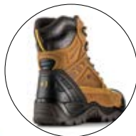
Driver's heel flex insert